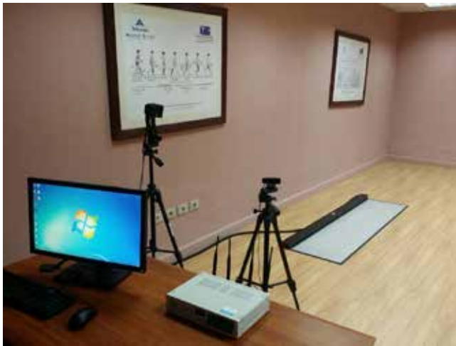
Figure 1. Walkway™ System Multi-Step Barefoot Analysis